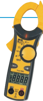
▶ 61-736 features: